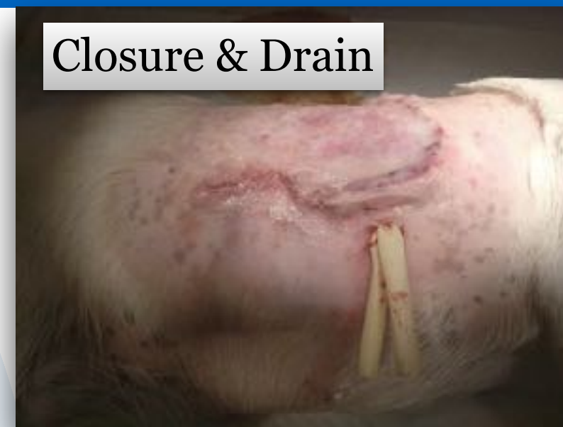
Closure & Drain

The next morning the wound was swollen and red. I decided to use doctorVet to improve healing with protocols for deep infection, general pain and inflammation.