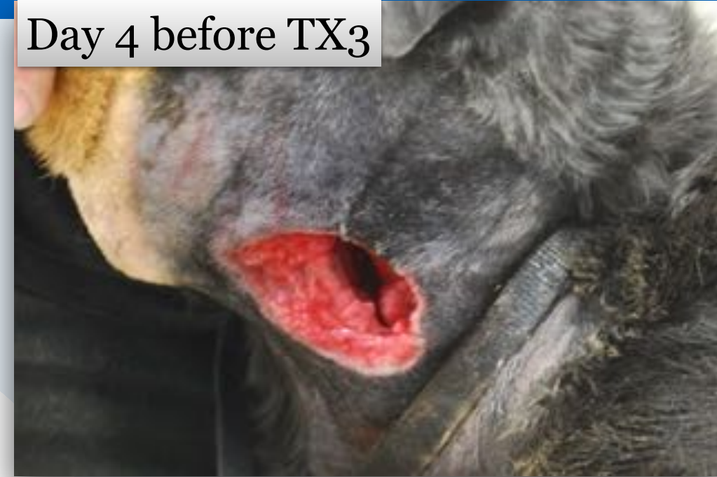
Day 4 before TX3