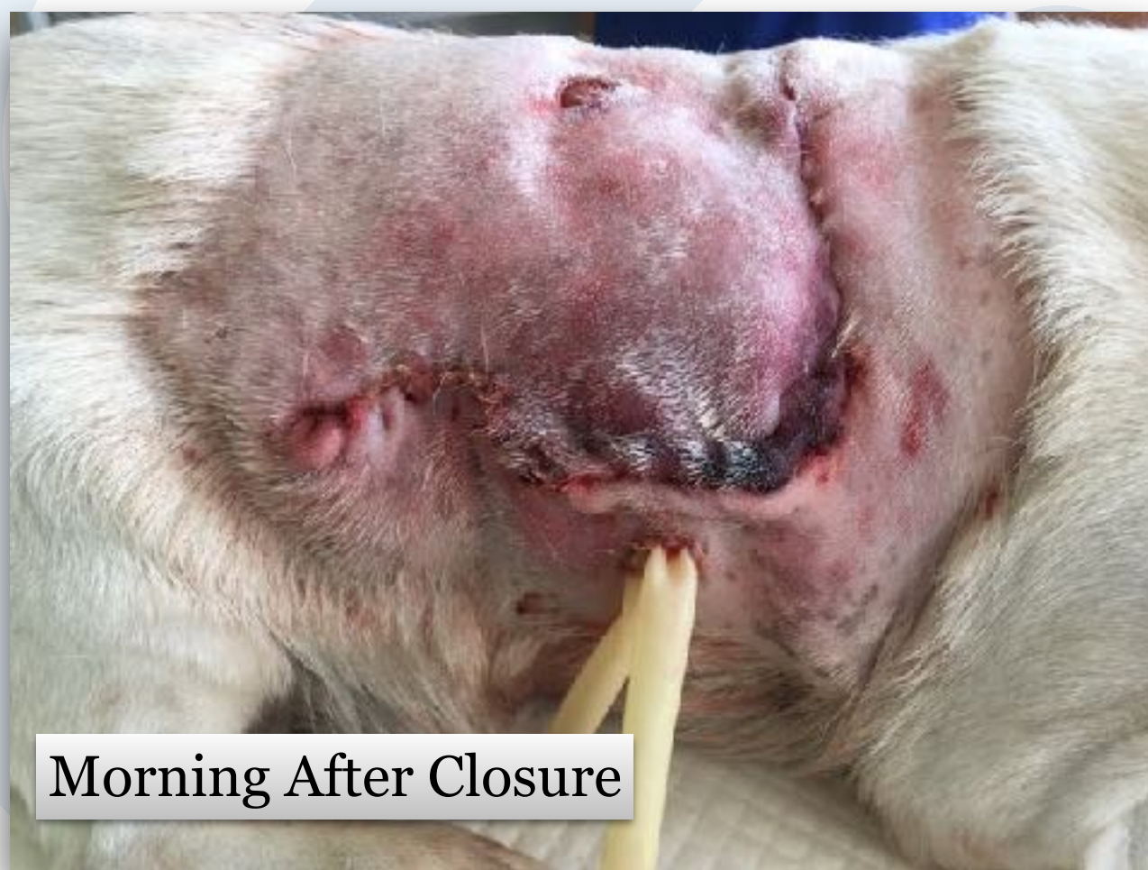
Morning After Closure