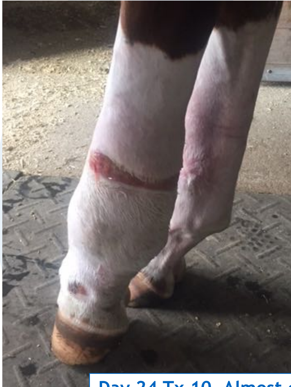
Day 24 Tx 10. Almost complete wound closure.