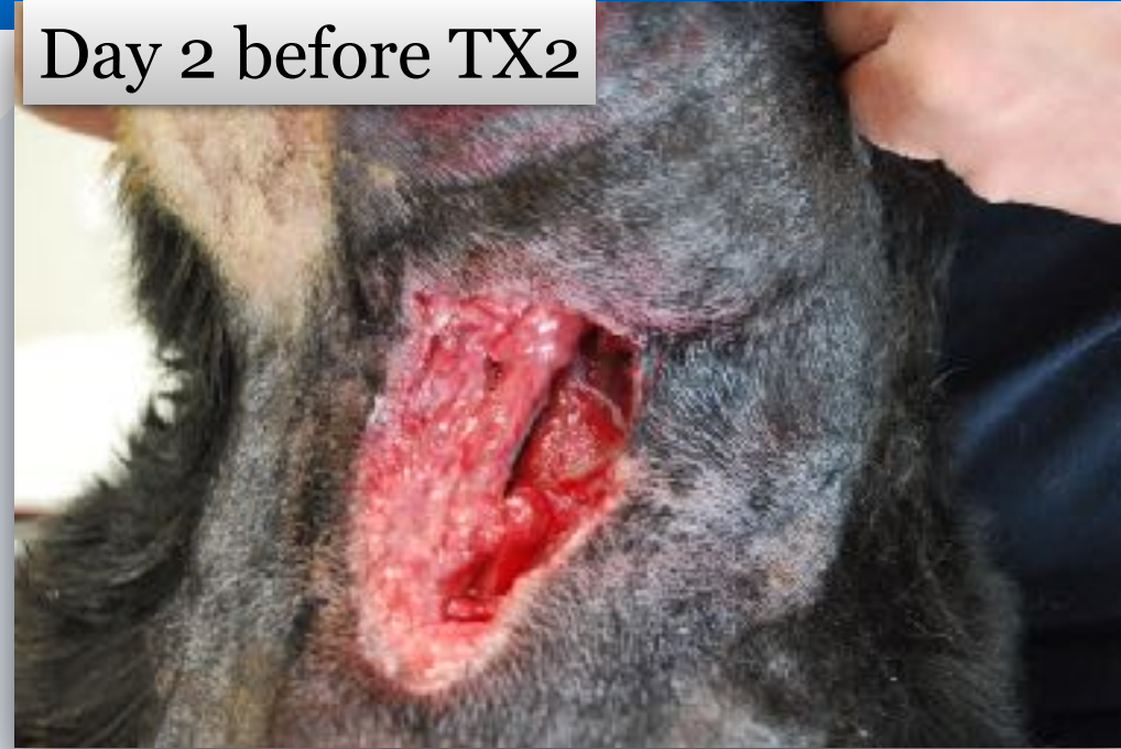
Day 2 before TX2