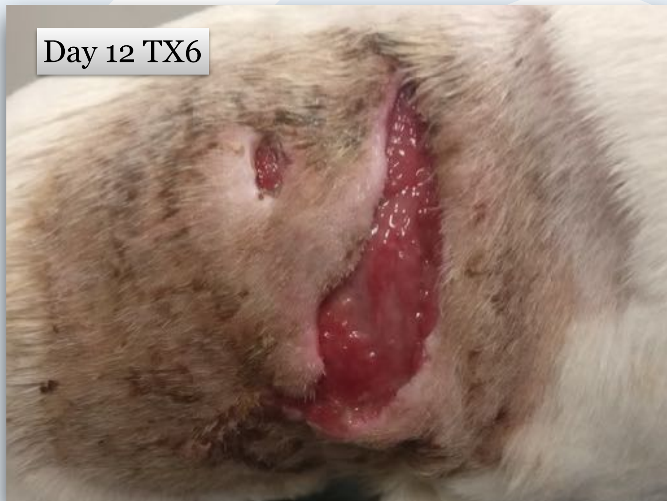
Day 12 TX6

Owners are very happy. They wanted to euthanize Ida because she was in so much pain.