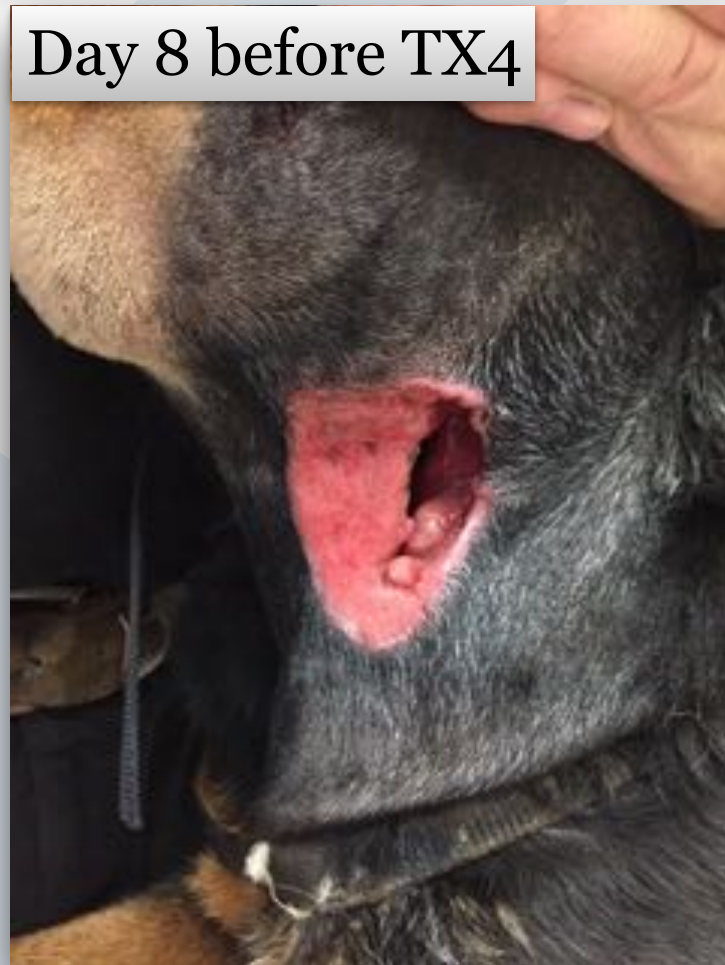
Day 8 before TX4