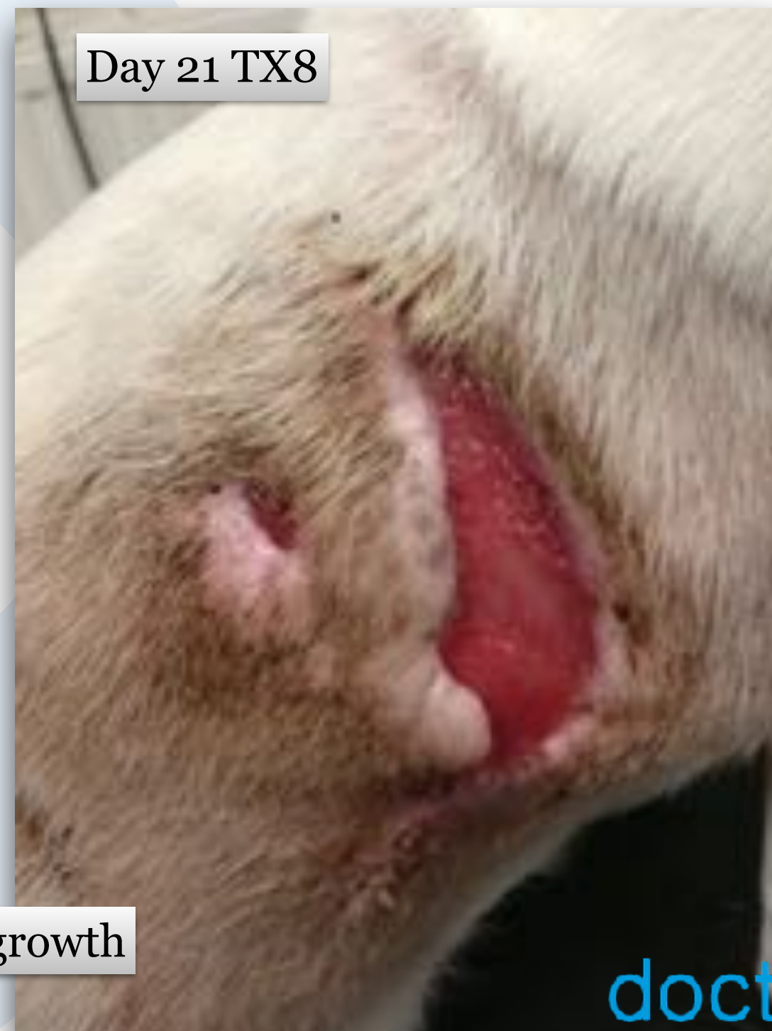
Day 21 TX8